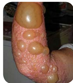
The blisters and moldings on the skin that the MAN OF GOD saw way back on October 8th, 2012.

manifests in the skin, but it looks more like a skin infection because I saw the manifestation on the skin and all over the sides of the body. There were