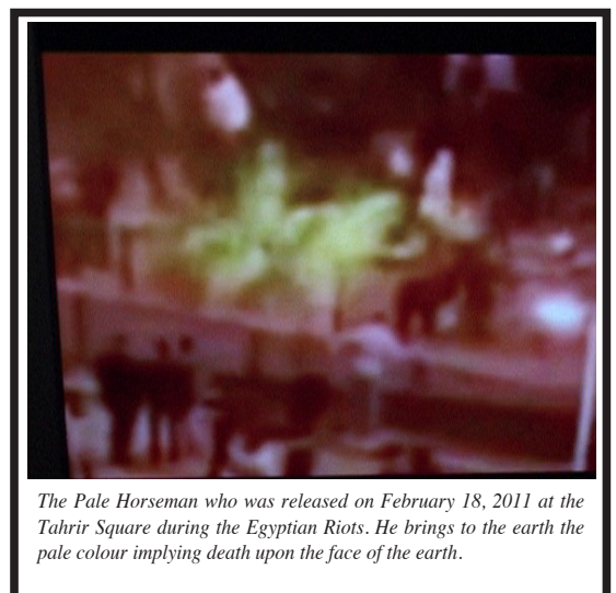
The Pale Horseman who was released on February 18, 2011 at the Tahrir Square during the Egyptian Riots. He brings to the earth the pale colour implying death upon the face of the earth.

pale one whose demeanour exuded a great authority of ferociousness all the way. However, what struck me most about his coming was the impunity of his advent, and the obvious display of his unstoppable determination to succeed in his mission. All this cruelty was well demonstrated in the narrative of the rage of his revered pacing across the face of the earth. Firstly, it was the sheer size of his build that stunned me beyond measure in that alarming vision. And secondly, it was the unmistakable cruelty of his mean appearance that gave it all away! This is what dealt its final blow on me, when it struck me speechless, that this horseman actually as a matter of fact beheld a deathly awe. At this point in that vision, I was already beginning to well perceive that indeed this would be the fiercest of all the four horsemen of the endtime. Within that vision, it was already becoming a very serious issue on how to maintain my composure, and yet still be able to grasp this most crucial message that the Lord was dispensing unto the nations. It was in that nick of time that finally the Lord drew the Pale Horse with his rider towards me. With the movement of respect and almost of fear, I stood on his way thereby causing him to come to a complete and an abrupt stop right in front of me. Death and hades indeed on that day came to a complete stop right before me.